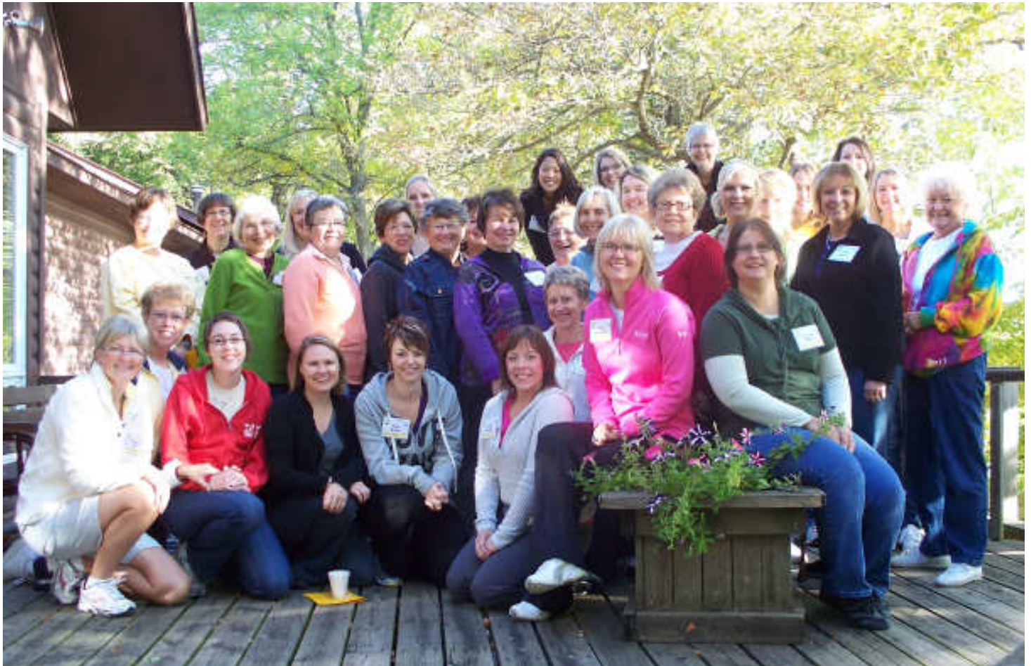
Spirit of Joy Women's Retreat ~ Shetek Lutheran Ministries—September 23-24