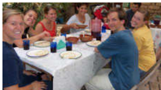
Making a visit while on retreat to the home of an indigenous Nanuet man and his family

Try to take some time this week to engage in intentional silence – consider the power of your speech, how and when you use it, and when it might be best to be still (Psalm 46:10).