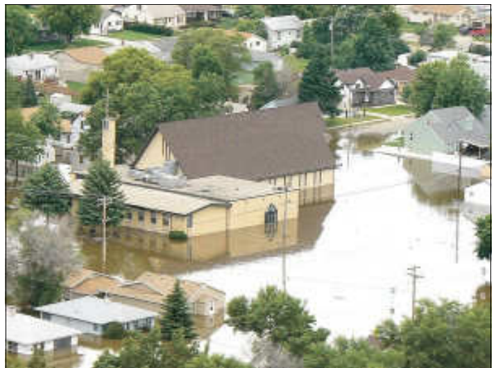
Christ Lutheran Church, Minot ND