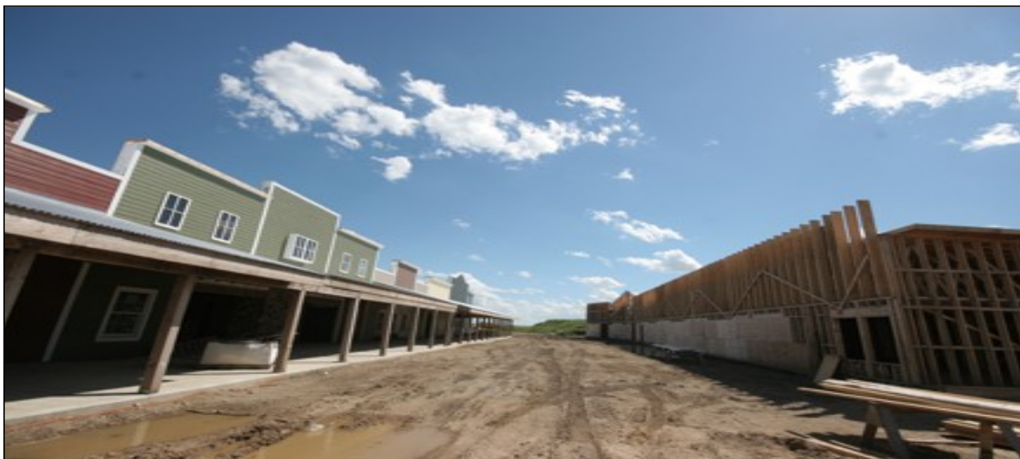
Photo of Joy Ranch's newly constructed "Main Street" – site of 2010 Quilt Auction (The street will be leveled and the mud will be gone!)

Please invite family, friends, and fellow congregational members to join you for a fun-filled day at Joy Ranch! The east side of the "Old West Town" facades and siding showcase our "Old West look", and you can now walk through the bunkhouses, commons, health-care, and adult retreat center to get a sense of the vastness of this project. All are welcome!